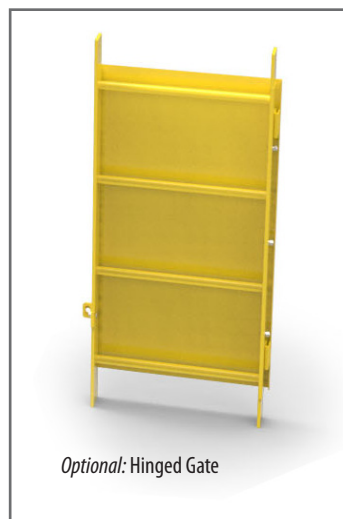
Optional: Hinged Gate

NOTE: All application requirements are different depending on site conditions. Acudor has provided their Ladder System in modular parts to allow a perfect fit for all uses. All components are sold separately. See a parts list and sample reference on the back of this page.